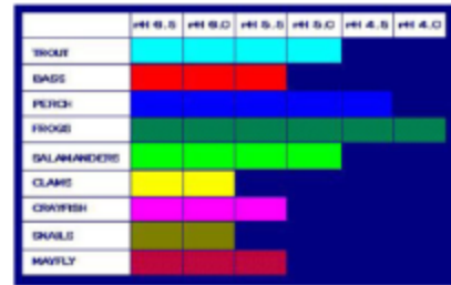
Figure 6. This table illustrates pH values that can be tolerated by different species.